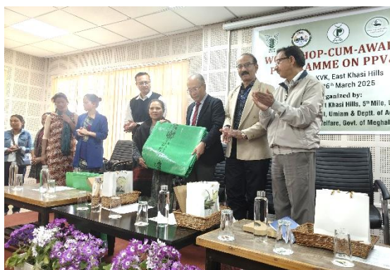
Distribution of Inputs to farmers