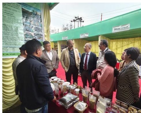
Dignitaries visiting the exhibition displaying the exotic and local plants germplasms