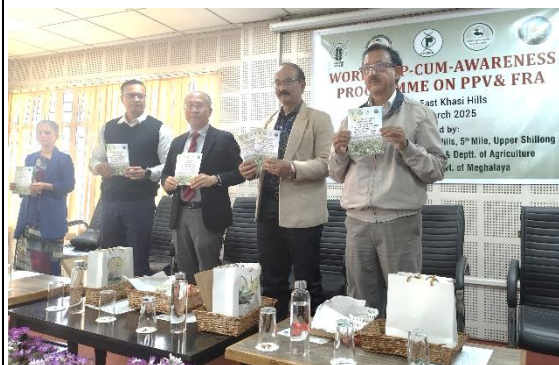
Release of a publication by dignitaries