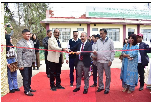
Inauguration of the Exhibition